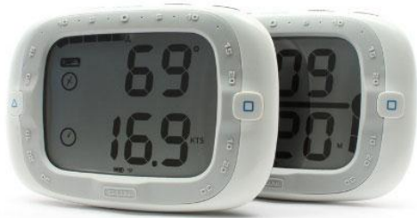
Velocitek – Best Distance to Line Tool ever $599