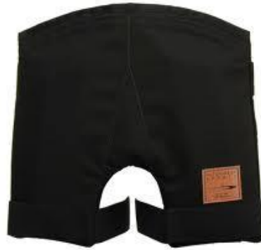
Hutchison Leg Saver Hiking Gear Contact us for full Hutchison Range of gear / covers